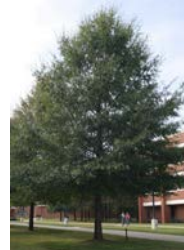
"Hightower" Willow Oak