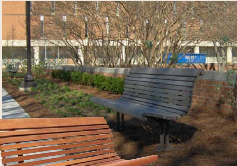
"Gretchen" full bench

Within this program, individuals or groups may fund the planting of a tree as a memorial to living or deceased alumni, families, and friends connected with the Institute or to commemorate a special event or activity. To permanently acknowledge those who have been recognized through the program, a bench will be placed near all commemorative trees, with the option of a personalized plaque. A list of trees and bench types, along with planting locations, will be provided for donors from which to select, with the final decision being made by Capital Planning and Space Management. A one-time gift of $10,000 is required to fund a commemorative tree and bench, ensuring proper maintenance of both as long as practicable.