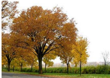
"Princeton" American Elm