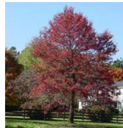
Tupelo or Black Gum